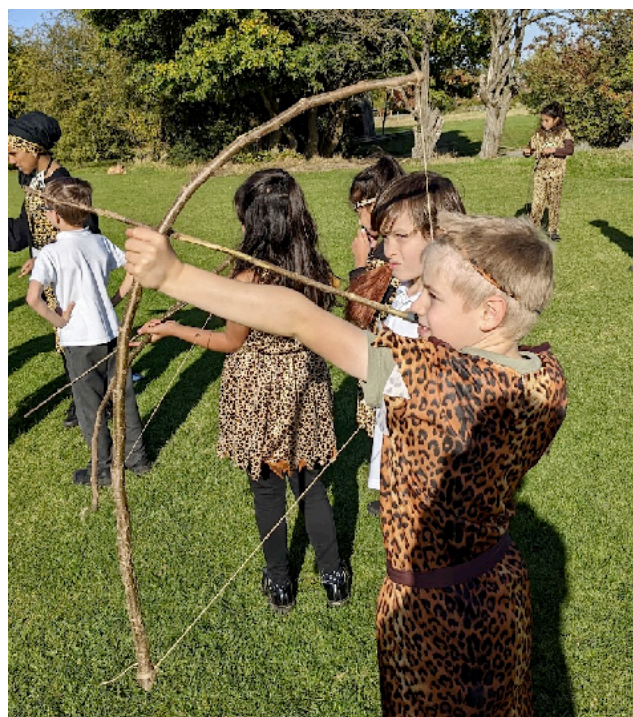
Y3 Stone Age Day was blessed with sunshine and was an enjoyable time until the last few moments. An unexpected wasp nest made the end of the day a bit too exciting.

Have parents seen these Knowledge Organisers? Key Stage 2 children should have electronic copies in the Google Drive for most topics in subjects such as science, history and geography.