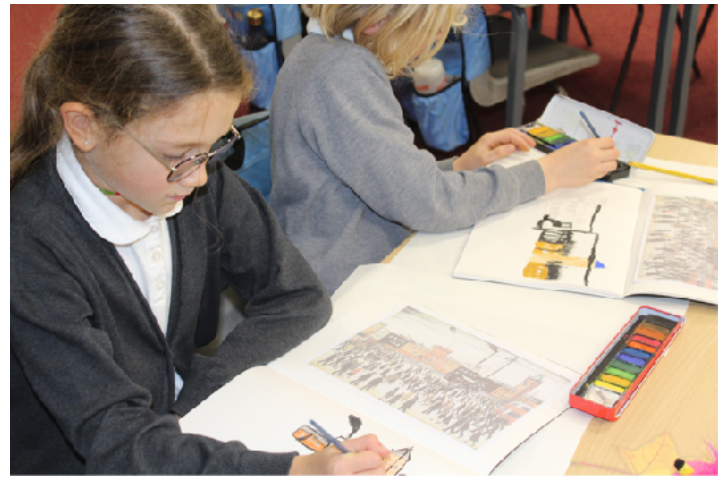
A new KS2 art curriculum has been introduced this year and the children are enjoying filling their higher quality sketchbooks.

We pride ourselves on our wide, rich curriculum, happy children, strong pastoral support and our inclusive culture. This data proves that our higher attaining pupils also perform as well as any.