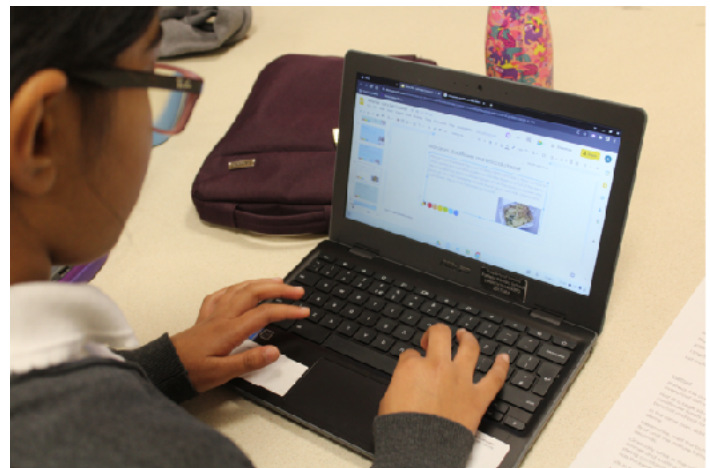
Our 1:1 Chromebook roll-out has been extended to Y3 this academic year. All the children in the juniors now have their own computing device to support learning in school and at home. Thank you to parents for their support with this.

A major task for the autumn term was the implementation of a new system around the administration and planning for children with special educational needs and disability. All our children on the SEND register should now have an Individual Provision Map (IPM) and parents should have access to this electronically at all times. The IPM will identify the child's strengths and needs and detail the provision that is in place to support them. It is reviewed and updated termly and the first review meetings were offered at the end of last term.