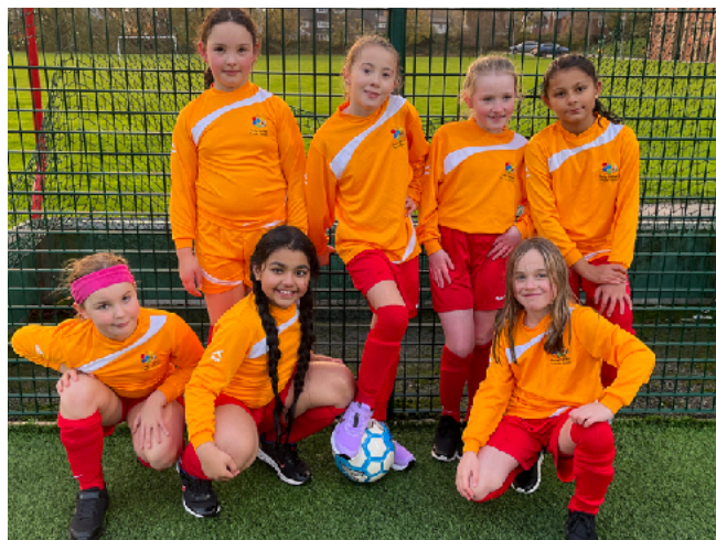
We are running four football teams again this year with lots of games having already taken place.