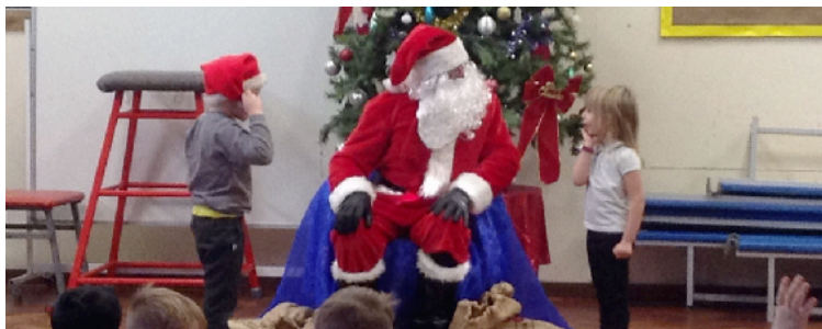
Our Reception children met Santa at Abbey House Museum and he even visited school too!