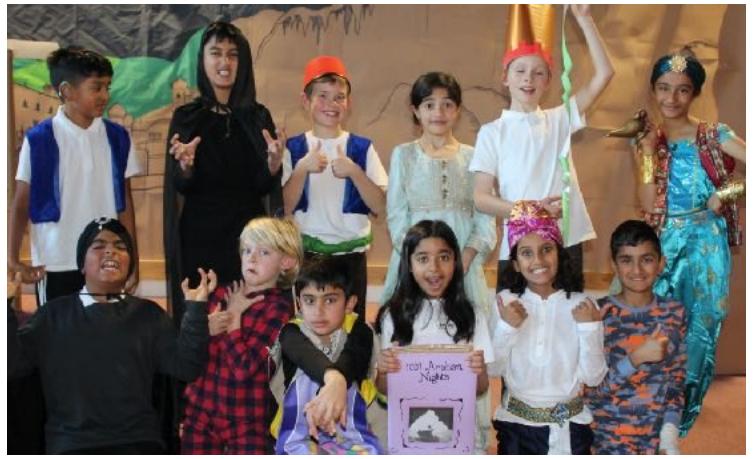
It was wonderful to have nativities and a show this Christmas: the first for three years. Y5 put on Aladdin.

We even had a staff panto on the final morning - thankfully, there were no cameras!