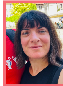
Eirini Social Media