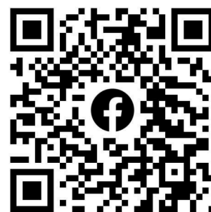
Farsley Farfield Parents Facebook Group

Details of upcoming events are posted on the Facebook groups and also on the PTA noticeboards in the school playgrounds.