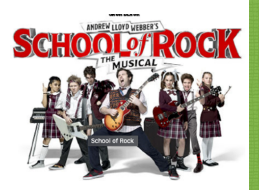
Please note that this event is during half term.