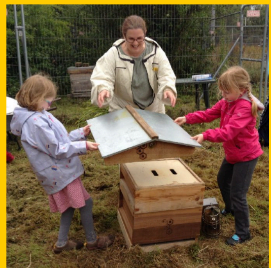
Year 2 children in a lovely outdoor bee workshop.