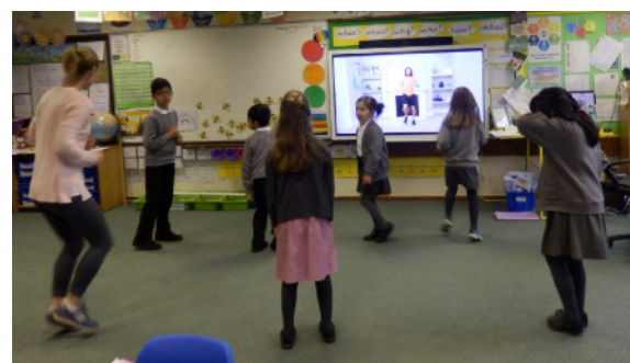
A KS1 Joe Wicks session at the height of the pandemic. Teachers and children will have to get used to having 30 children in a class again!

We are confident that our hygiene measures and bubble arrangements for September provide a COVID-secure environment to welcome back all children this term - we can't wait to see everyone!