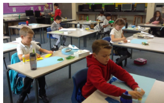
Socially-distant Y2s in a June bubble. Classes in September will typically be 30, with pairs of children all facing forwards from Y2-6.