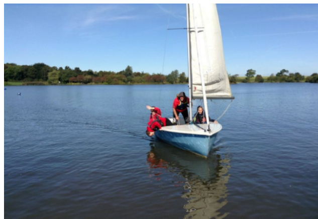
Year 6 had an experience of wind-powered transport when they went sailing on Yeadon Tarn in September. This 'work' related to their book study 'Kensuke's Kingdom' and the school's 'Outdoor and Adventurous Activities' strand of the PE curriculum.

We hope that those picking up and dropping off will also take notice of the 'No idling' banner and signage that has appeared outside the Juniors and along Cote Lane. Although the weather is getting colder, modern cars are easily able to be kept warm for 10 minutes without leaving the engine on.