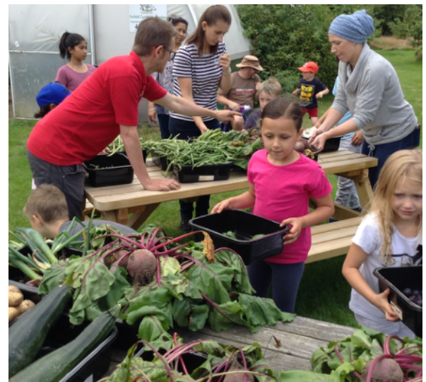
A photo from one of the two family sessions run on the school farm over the summer holidays. In recognition of our school's commitment to this sort of work, our school has been invited to present at the national conference of Learning Outside the Classroom and to chair the Northern School Food Conference at Leeds Civic Hall.