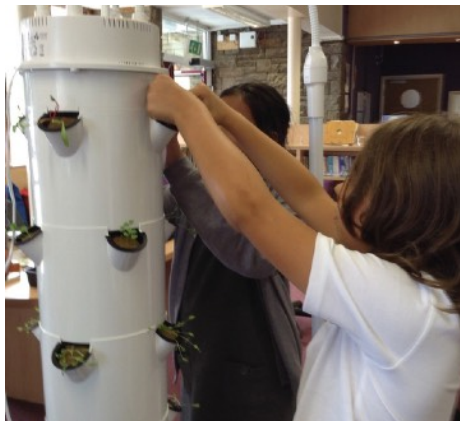
Y5 pupils adding plug plants in rock wool to the tower.