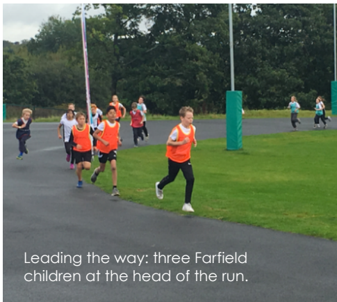
Leading the way: three Farfield children at the head of the run.

We were astonished when we got the full day's results: Farfield A were first and Farfield B were second out of 37 teams! This really is a stupendous result and shows what a fit group we have in Year 5. They are well-known as a terrific cohort and they do try hard in their daily runs. We know that some of them also run with parents and clubs. Well done!