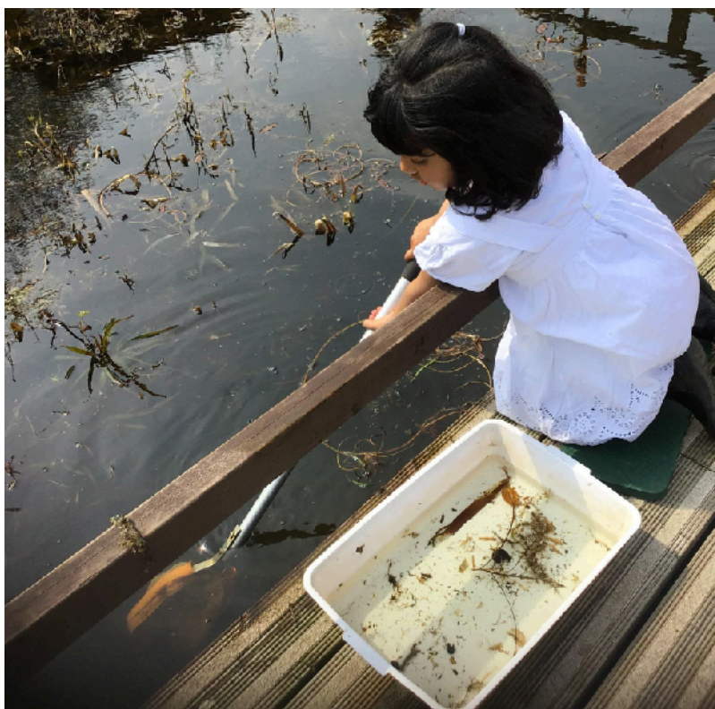
Year 1 have a rich pond-dipping experience at the fabulous Ridley Nature Reserve

Monday 2nd and Tuesday 3rd September 2019 will also be Training Days (partly to help us to get the school back together after summer works).