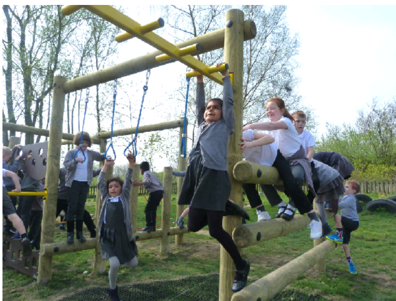
New play equipment on the infant site

Our grounds are exciting places for children to play and we hugely value this part of the school day. Despite our best endeavours, there will still, occasionally, be accidents. We have lowered the monkey bars slightly on this equipment after a child fell awkwardly.