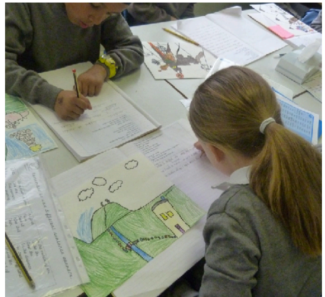
Hard at work in Year 2

Our Communication Policy is on the website. This policy includes target times for responding to emails and other forms of communication. Staff will aim to respond to parental emails within 2 working days. Phone calls will usually be replied to within a working day and letters acknowledged within 3 working days. Parents need to be aware that part time staff are not expected to reply to communications on days that they are not working.