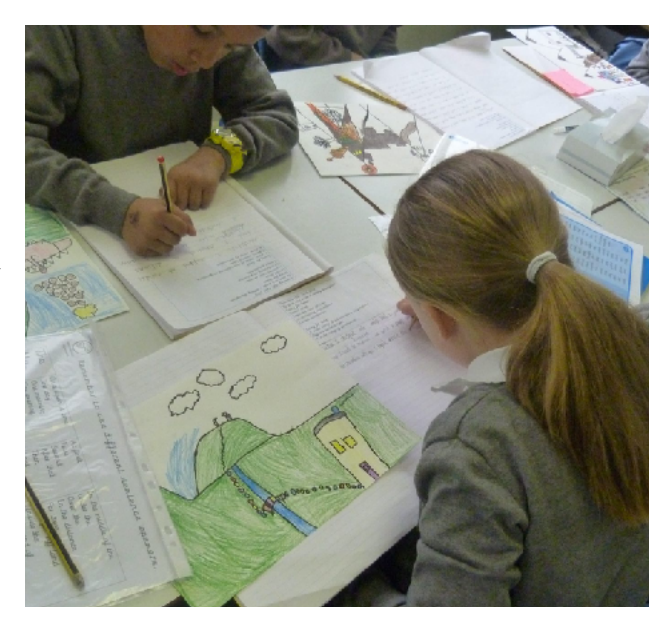
Hard at work in Year 2

Our Communication Policy is on the website. This policy includes target times for responding to emails and other forms of communication. Staff will aim to respond to parental emails within 2 working days. Phone calls will usually be replied to within a working day and letters acknowledged within 3 working days. Parents need to be aware that part time staff are not