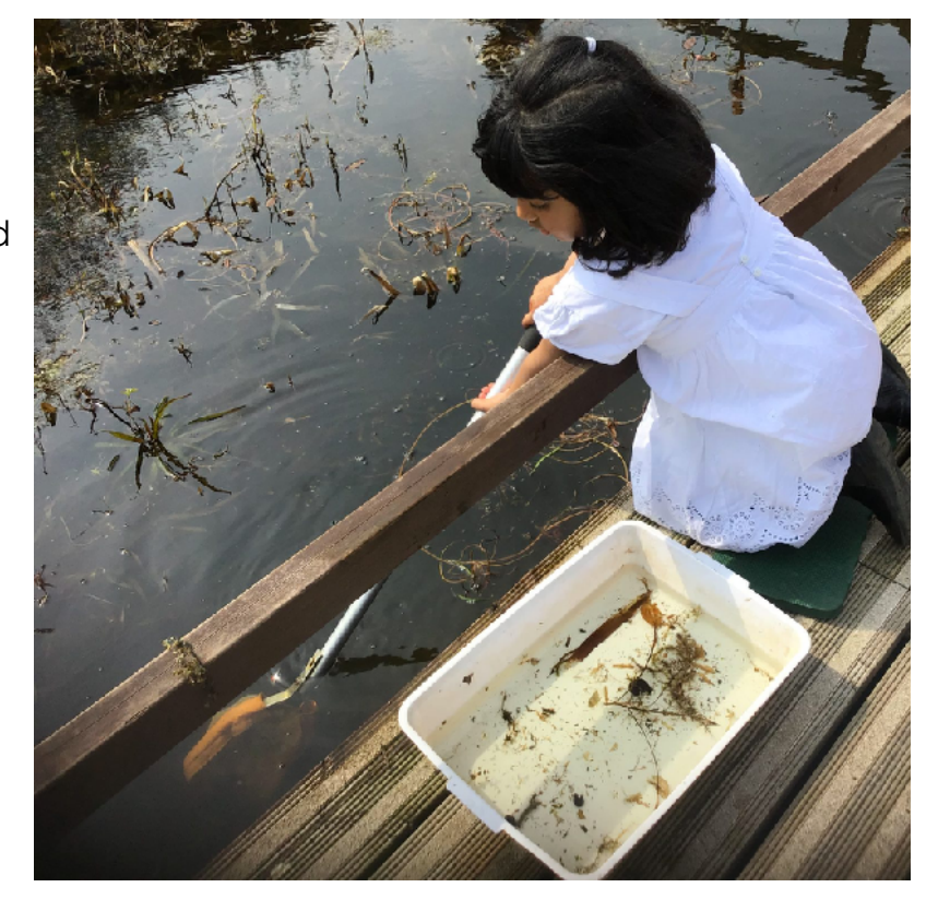
Year 1 have a rich pond-dipping experience at the fabulous Ridley Nature Reserve

Monday 2nd and Tuesday 3rd September 2019 will also be Training Days (partly to help us to get the school back together after summer works).