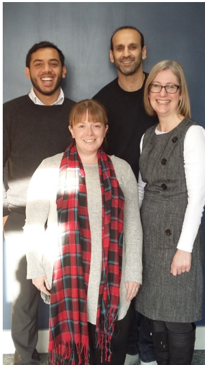
The Leeds Prevent Team

Welcome to the first Prevent Education update of 2018.