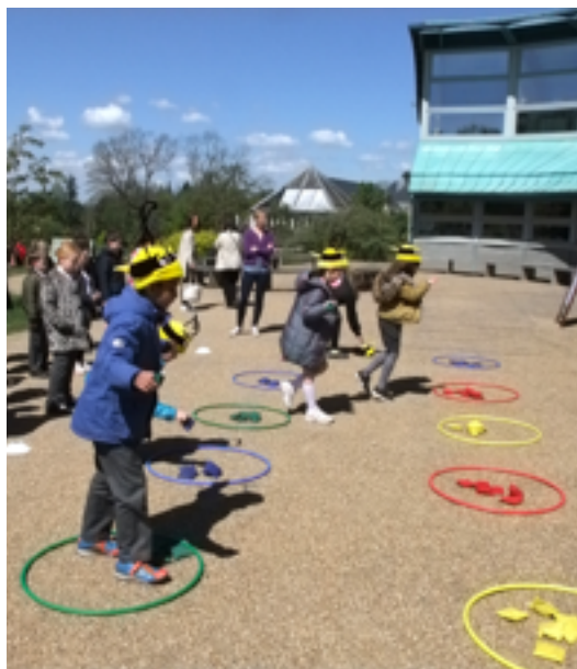
Busy Y3 bees learning about pollination at Harlow Carr

In the last half term, children have had a wealth of opportunities to learn about and celebrate the natural world around them.