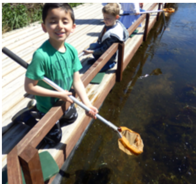
Year 1 pond-dipping at Rodley Nature Reserve - what a wonderful resource on our doorstep