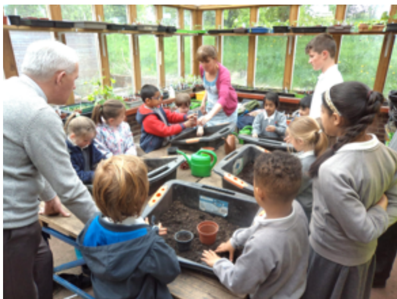
All the infant children have spent time on the farm last half term, often working with older children