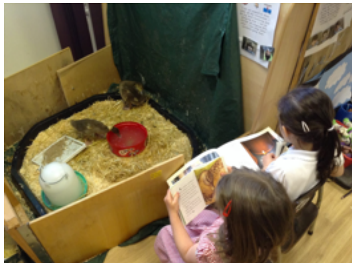
Eden and Isla didn't want the two remaining ducklings to feel lonely, so they read them stories.