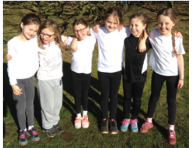
Gritty and determined: the Y4 girls' cross country team

Thank you to all the staff that have supported sporting events this year - we couldn't do it without you!