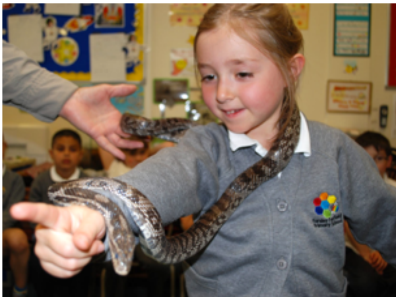
All sorts of exotic and exciting animals came to visit Year 1