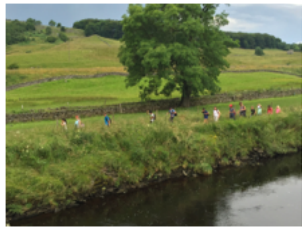
Year 4 visited Horton in Ribblesdale in July as a contrasting village study.