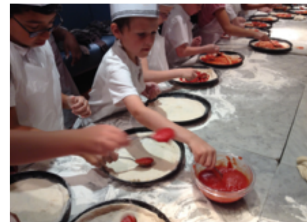
A tasty trip: Year 3 at Pizza Express.