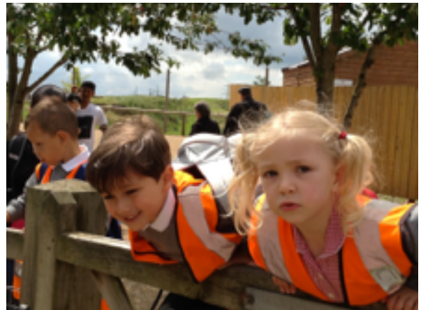
Straining for a closer look: Reception visited the Yorkshire Wildlife Park. Sadly, this proved to be the last trip for the 'old bus'.