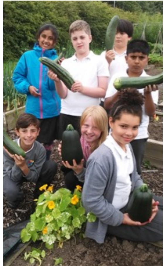
Juniors harvesting as part of their Farfield Farm summer sessions. From September, this will be added to Year 2 as well. Younger children will still be able to visit with their classes.