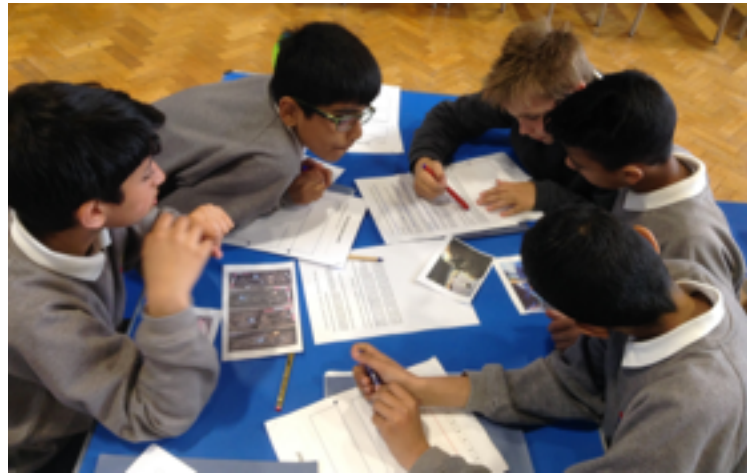
Year 6 working on some collaborative history work relating to the Romans.