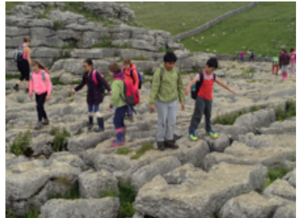
Year 5 visited Malham to study rivers, waterfalls and geology.