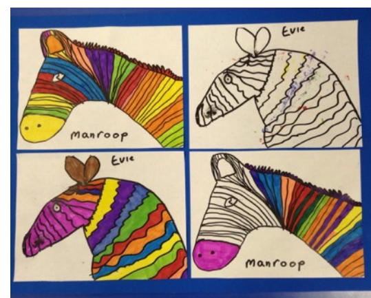
Years 5 and 6 designed and made their own masks over a half term whilst Year 2 explored 'Pop Art'