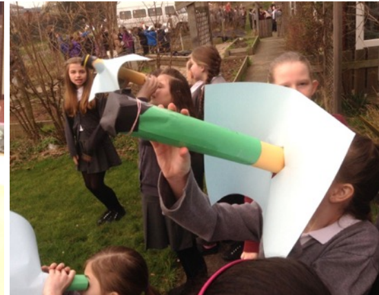
Year 3 investigating magnets, Year 5 measuring carefully and Year 6 safely observing the eclipse