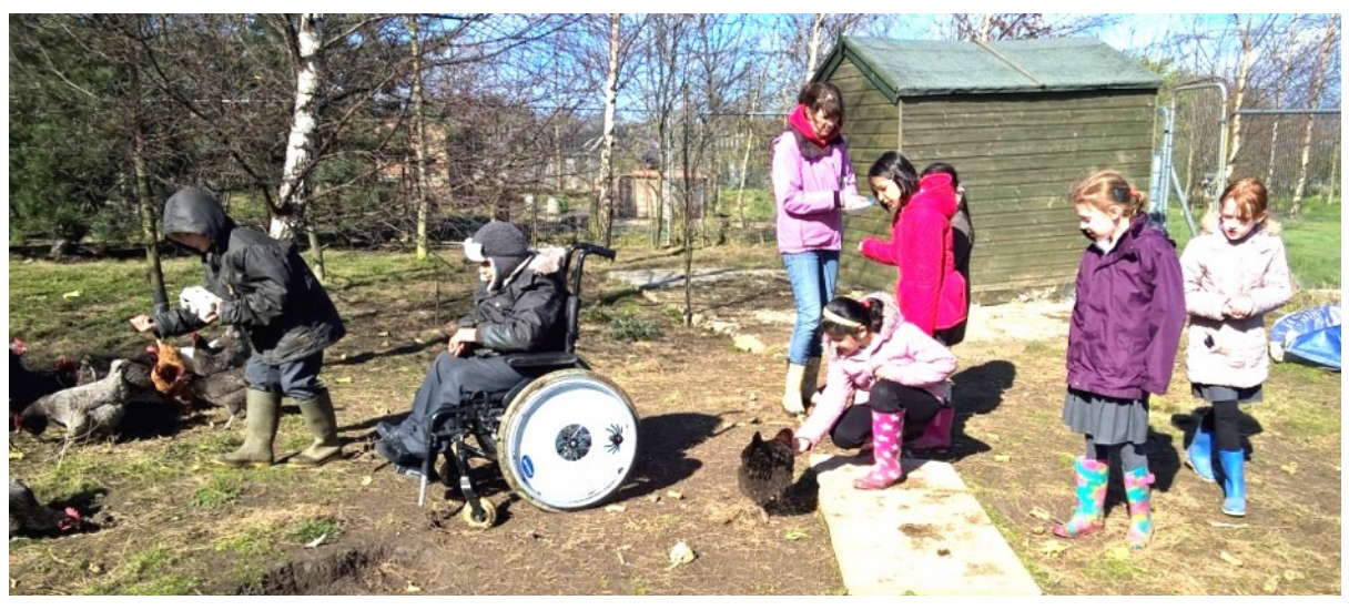
Year 4 children feeding the chickens during one of their Farfield Farm afternoons