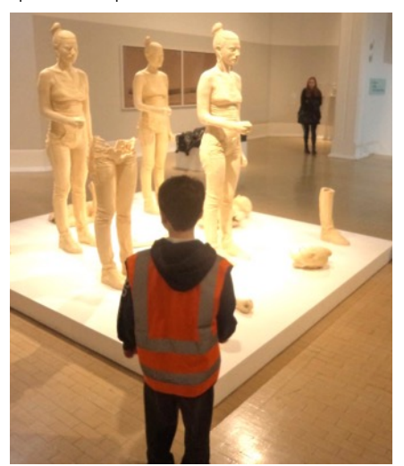
Year 1 visited a gallery, created their own works and opened their own gallery