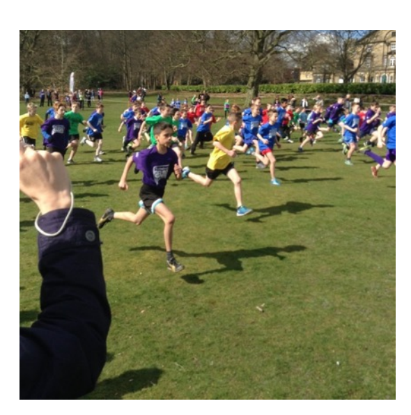
Hundreds and hundreds of children attended the West Yorkshire Winter Youth Games and Farfield provided many of Leeds' entrants for the cross-country event. The competition was fierce and it was a great experience for our children.