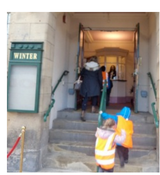
Y1 at a theatre