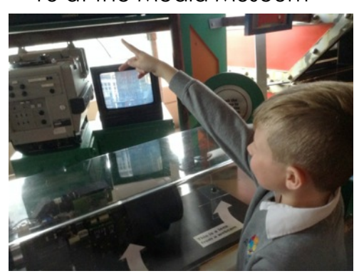
Y3 at the Media Museum