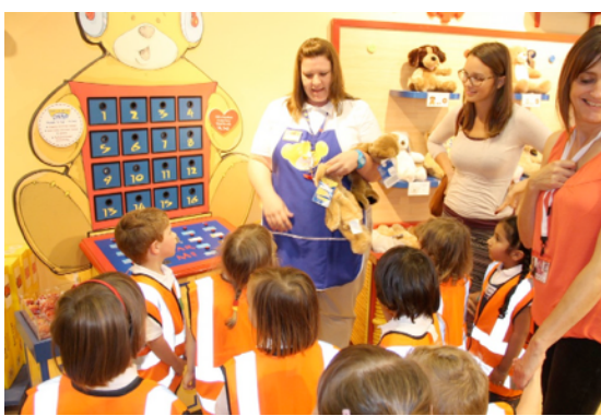
Some Reception children at 'Build a Bear'