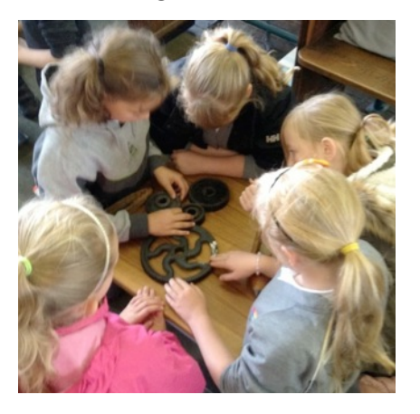
Cogs and gears at the Bradford Industrial Museum