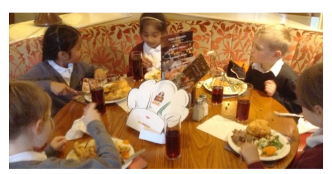
Y2 learning about food at Toby Carvery

Already this term, all classes have enjoyed at least one educational visit around Yorkshire. Many thanks to all the parents that have been able to support these visits - some trips couldn't take place without your help.