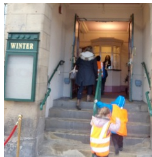
Y1 at a theatre