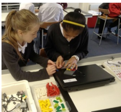
Y5/6 Lego workshop at Crawshaw High School