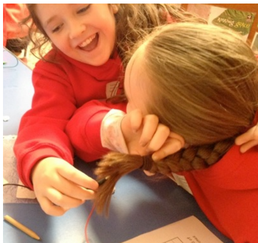
Fun for Y4 at Skelton Grange