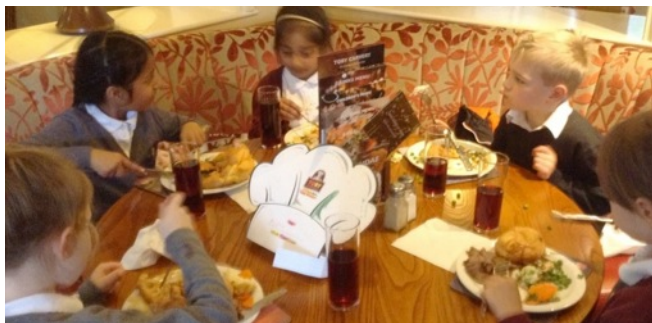
Y2 learning about food at Toby Carvery