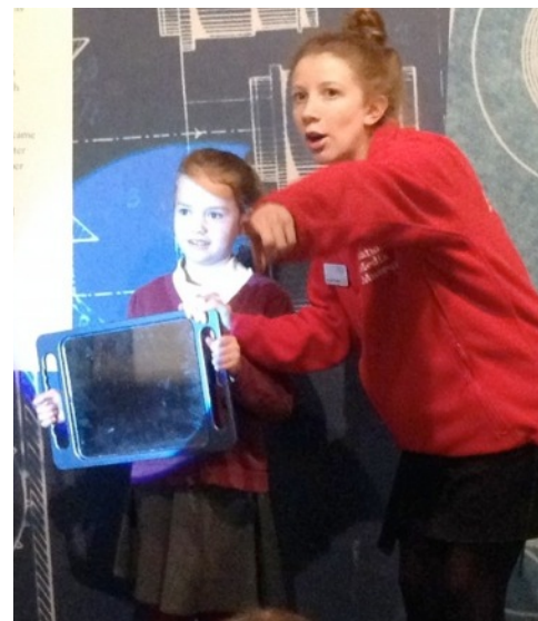
Y3 at the Media Museum