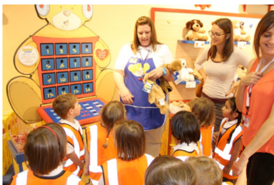
Some Reception children at 'Build a Bear'