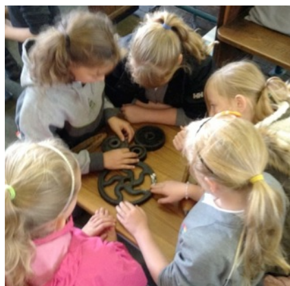
Cogs and gears at the Bradford Industrial Museum