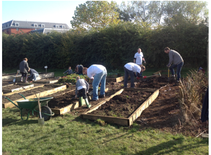
Volunteers working alongside a group of children from Y5

Does your company encourage volunteering like this?