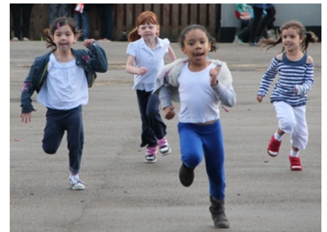
Last year, we had to have Sports Day on the yard. Better weather this year?

The children will be active all day: as well as their traditional sports day, they will have another half day of less competitive sporting fun.