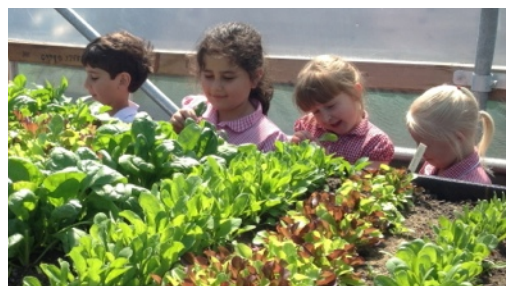
Y1 pupils enjoy tasting a variety of salad grown in polytunnel 1

We have been really pleased with the start of 'Farfield Community Gardens' - the post-lottery partnership between school, parents, the Children's Centre and Farfield Fun Youth Club to help cultivate the top field. Volunteers from Barclays helped set up the raised beds in polytunnel 2 and the lottery paid for the recent fencing. The Barclays volunteers, led by Lindsay Wallwork (Louis' mum in Y3), are back next month to help us build a further enclosure for our chickens and newly-arrived ducks.