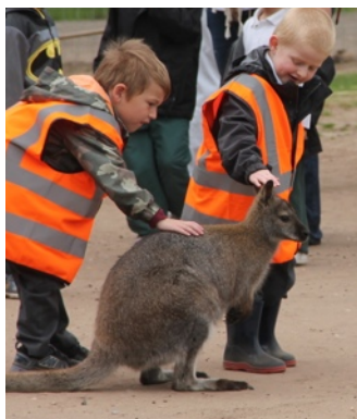
Reception at the Yorkshire Wildlife Park

Educational day visits continue to be an important part of Farfield's curriculum offer. Years 3 and 4 had an epic day visiting Horton in Ribblesdale including a train journey and a visit to a quarry. Key Stage 1 had a great day at Blackhills camp including den-making, minibeast hunts and blindfold games and they were made to feel very welcome at the Kingdom Hall. Reception have recently visited the Rodley Nature Reserve (a hidden gem!) and the Yorkshire Wildlife Park. Our keenest cyclists met the Tour de France legend Bernard Hinault in May. This month, KS1 are visiting Skipton Castle, Nursery are going to Hesketh Farm and Year 6 are going on residential to Northumberland.