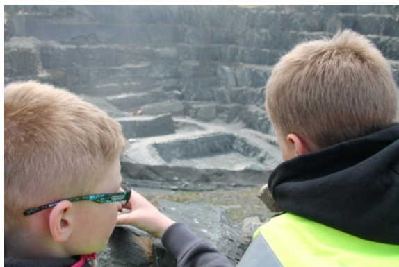
Year 4 pupils overlook a quarry in the Dales