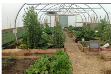
New raised beds in polytunnel 2, courtesy of Barclays and the lottery, are growing well following their adoption by 14 of our families