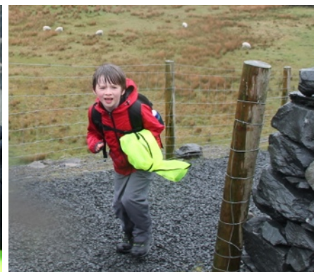
The weather in May was cold, wet, windy and grim for Y3 on their trip to Horton in Ribblesdale!