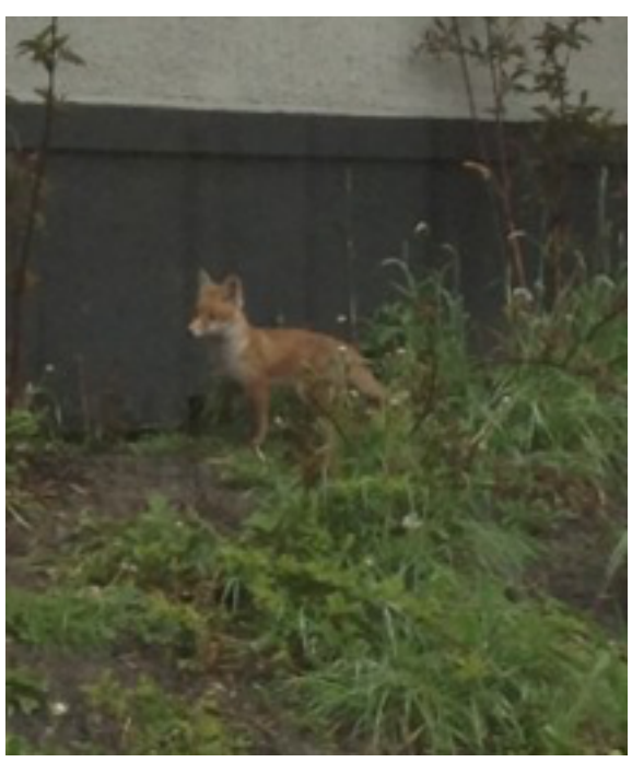
Good job s/he didn't pop out like this during the SATs!

These arrivals have led to a mini-topic in 6CH and debate in school council and assembly. At the moment we intend to let them be and simply ensure that our livestock and bins are secure.