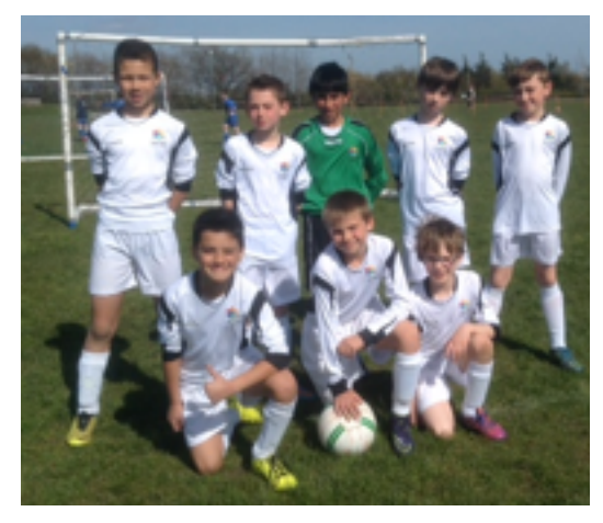
Local football champions