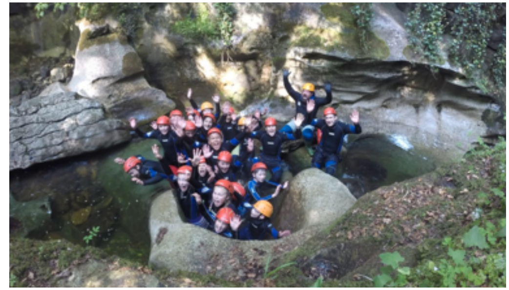
6CH 'Gorge Walking' at How Stean on Monday

camping (lucky with the weather) and are engaged in some very challenging OAA including abseiling, gorge walking, kayaking and 'via ferrata'.