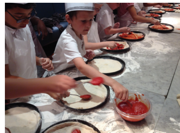
A tasty trip: Year 3 at Pizza Express.