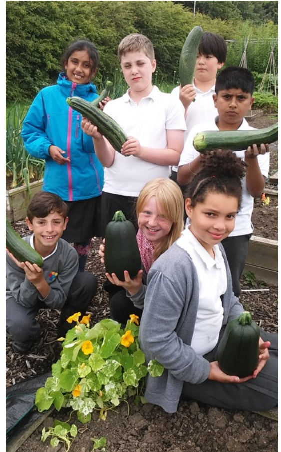
Juniors harvesting as part of their Farfield Farm summer sessions. From September, this will be added to Year 2 as well. Younger children will still be able to visit with their classes.