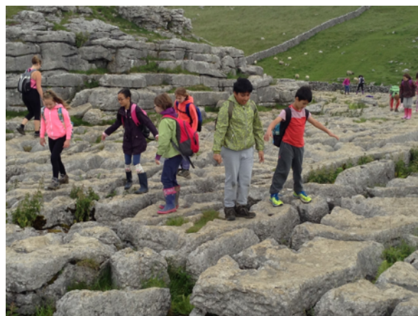
Year 5 visited Malham to study rivers, waterfalls and geology.