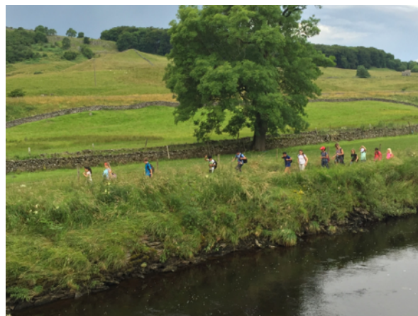
Year 4 visited Horton in Ribblesdale in July as a contrasting village study.