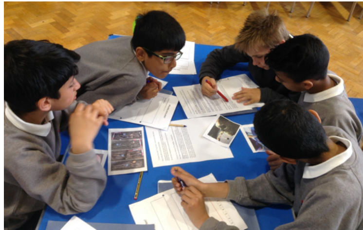
Year 6 working on some collaborative history work relating to the Romans.

Year 2 SATs were a completely new system this year so historical benchmarks are not appropriate and national figures haven't been released yet. Our reading, writing and maths scores were around the Leeds average in terms of children meeting the expected standards, but the numbers of children at Farfield reaching the more challenging 'greater depth' standard in all areas seems higher, especially in reading.