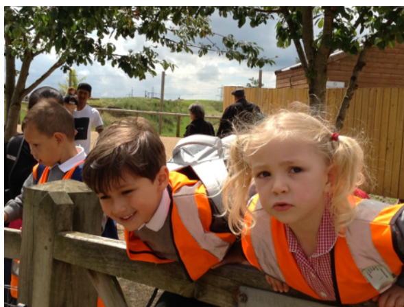
Straining for a closer look: Reception visited the Yorkshire Wildlife Park. Sadly, this proved to be the last trip for the 'old bus'.