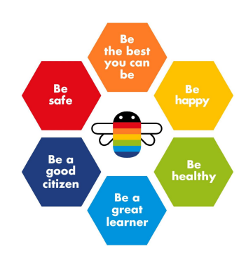
The Farsley Farfield Learning Hive