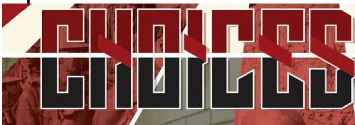
THE CHOICES WE MAKE DEFINE THE PEOPLE WE BECOME.

Leeds City Council Prevent is pleased to offer this touring exhibition and workshop programme created by the Peace Museum to Leeds schools.