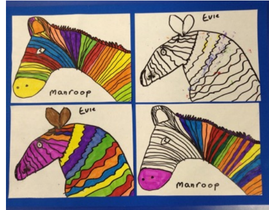
Years 5 and 6 designed and made their own masks over a half term whilst Year 2 explored 'Pop Art'