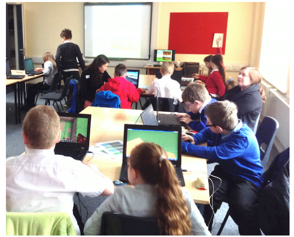
Children from Springbank, Waterloo and Southroyd joined us for the Minecraft Day.

Comment on website: "I know one of the children who was lucky enough to come to the Minecraft enrichment day on Friday. He sought me out to tell me what a great time he had had, and that he thinks Farsley Farfield is 'amazing, awesome, and SO big!'. (My daughter) was very proud to be able to show her school off to one of her friends."