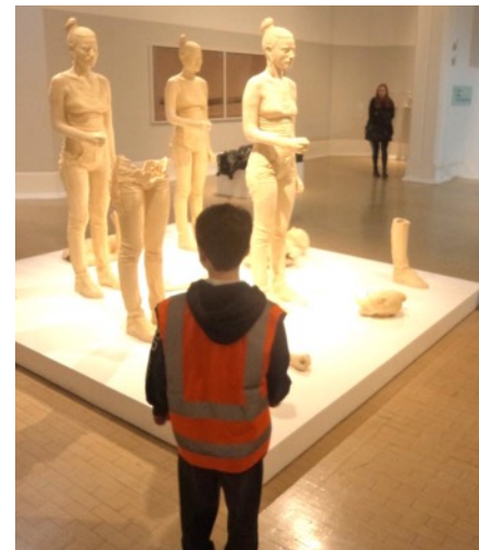
Year 1 visited a gallery, created their own works and opened their own gallery