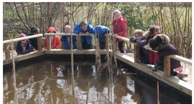
2H pond dipping at Skelton Grange