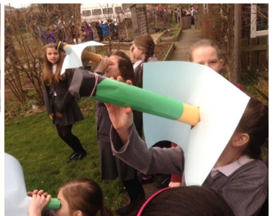
Year 3 investigating magnets, Year 5 measuring carefully and Year 6 safely observing the eclipse