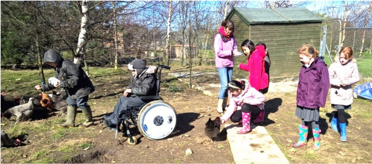
Year 4 children feeding the chickens during one of their Farfield Farm afternoons