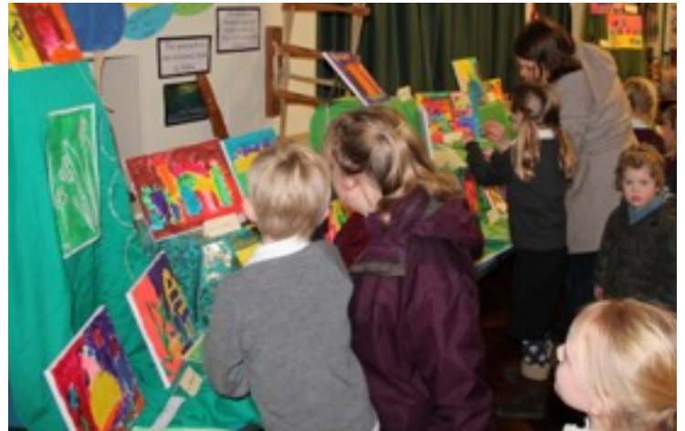
The gallery was so busy - thronging with children and parents!

We currently have a vacancy for a school gardener/groundsperson. Details of this post can be found on the front of the school website. Closing date is Monday 3 rd March.