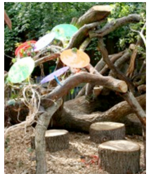
This is NOT an accurate representation of what is planned, but it might give you a sense of some of what we are working towards in the FS playground

This work (and other developments) is being funded by the PTA (many thanks!) and an unexpected windfall from Scottish and Southern Electric due to mis-billing.