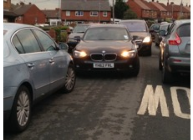
Parking in the area makes driving difficult and leads to confrontations

I have been told that our proposal to run a trial scheme that will give some Farfield parents free access to Pudsey Civic car park for short periods around 9am and 3pm has been approved by the council's Asset Management Board. I will write separately about this when more details emerge.