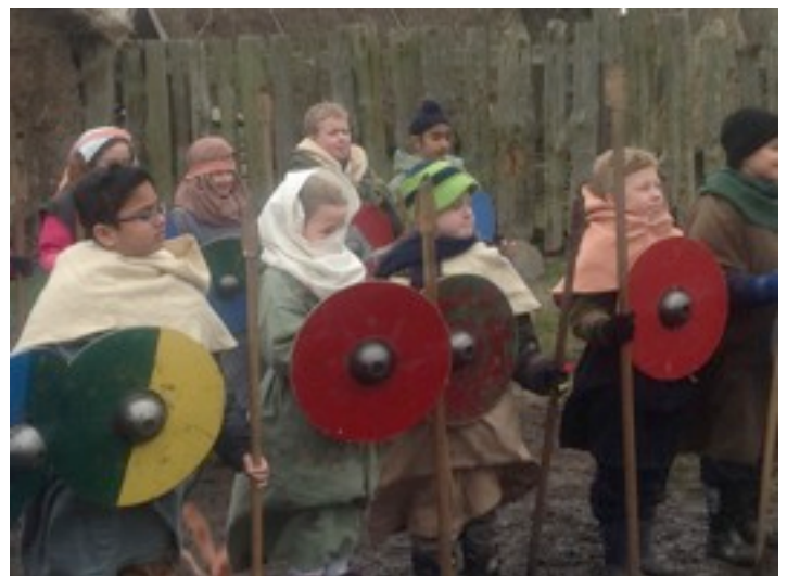
Year 3 guards brave the elements and defend the Saxon village

Years 3 and 4 braved the elements and each spent a day at Murton Park as Anglo-Saxons. In authentic costume, the children learnt about food and farming, domestic life, pottery, life under a 'thane' (landowner) and the drills of a guard. They had a banquet in the main hall and enjoyed having a distinguished 'bondee' in the stocks. The knowledge of the Murton Park staff and the way that they looked after us was very impressive.