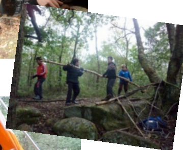
Years 5 and 6 were problem solving and team-building at Blackhills Woods as part of their 'Shelters' topic