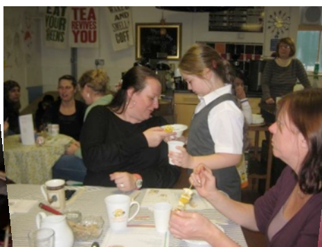
Serving in the Cafe as part of Y3/4's Healthy Eating Day