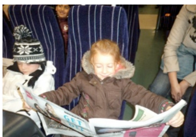
The Y1 and Y2 children enjoyed travelling by train.

We have started the new school year with a slew of successful educational visits. Farsley Farfield is absolutely committed to maximising the number of visits that supplement our classroom curriculum and by the end of this term, the whole school (except Nursery) will have been on at least one trip already this year and many will be on their second or third!