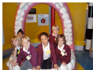
Key Stage 1 visited Eureka as part of their 'I am special' topic