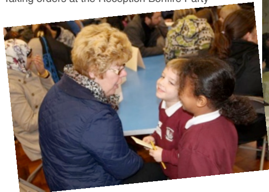
Taking orders at the Reception Bonfire Party

Children in Reception and in Years 3 and 4 have recently welcomed parents to school as part of a Bonfire Party (Rec) or a Healthy Eating Day (Y3/4). Children prepared food and learnt how to serve to 'customers' in the infant hall or in the cafe.