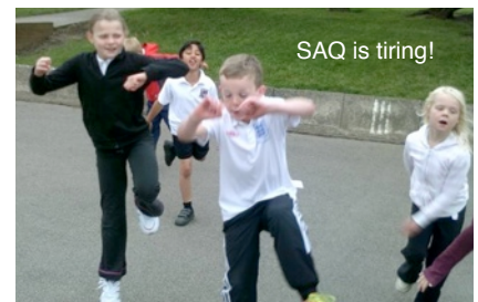
SAQ is tiring!

We are delighted to now be working with GymMagic and Pudsey Judo in core lesson time (and extra-curricular clubs), as well as introducing more 'Outdoor and Adventurous Activities', cycling and new sports such as Ultimate Frisbee.