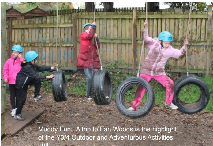
Muddy Fun: A trip to Fan Woods is the highlight of the Y3/4 Outdoor and Adventurous Activities unit

Children in Y3-6 are now experiencing their PE curriculum in extended afternoon sessions that include 45 minute 'Speed, Agility and Quickness' sessions followed by PE modules for which the children have had an element of choice.