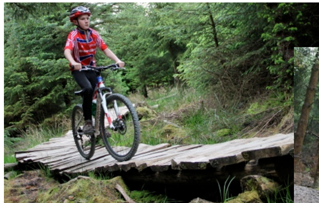
The mountain biking was exciting and the skills progress was phenomenal!