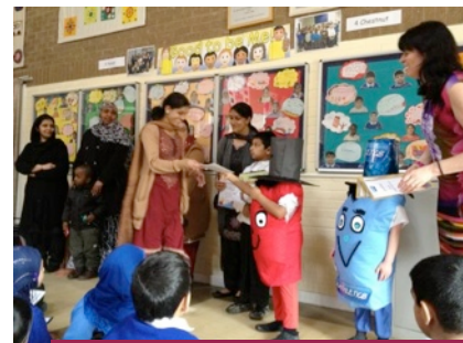
Mums receiving 'Gold' from the Mathletics mascots at Hovingham