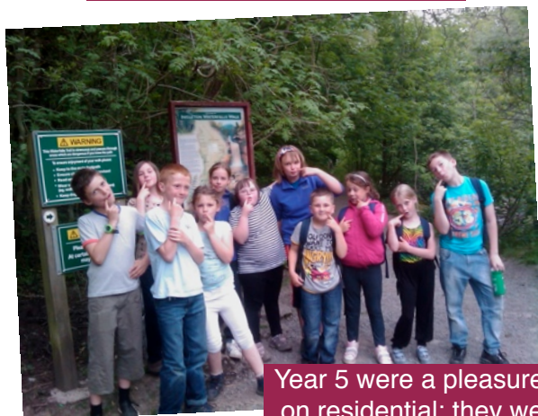
Year 5 were a pleasure to take on residential; they were very supportive of each other.