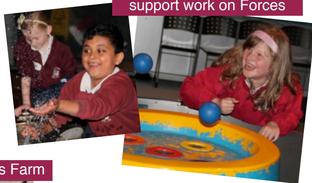
RS went to St Leonard's Farm