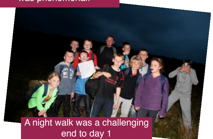
A night walk was a challenging end to day 1