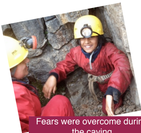
Fears were overcome during the caving