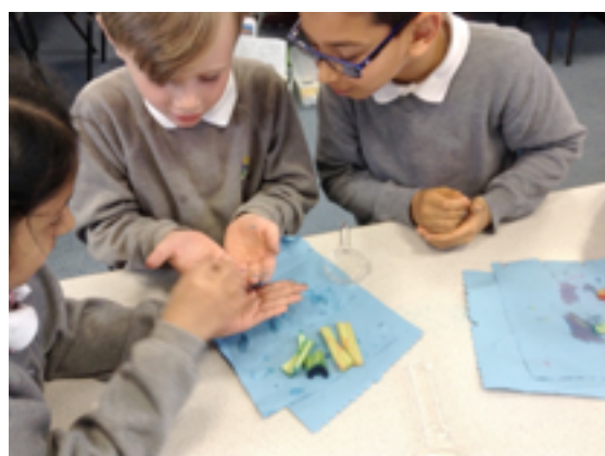
Year 3 investigating the purpose of a plant stem

Staff and governors have had input into a revised draft policy on this area, but I have decided not to share this with parents until I can make amendments based on the publication of the new model scheme of work.