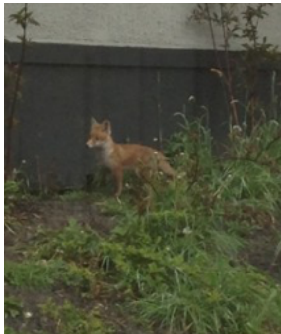
Good job s/he didn't pop out like this during the SATs!

These arrivals have led to a mini-topic in 6CH and debate in school council and assembly. At the moment we intend to let them be and simply ensure that our livestock and bins are secure.