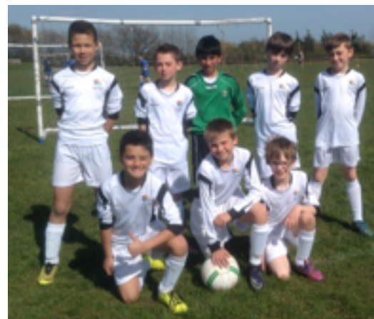
Local football champions