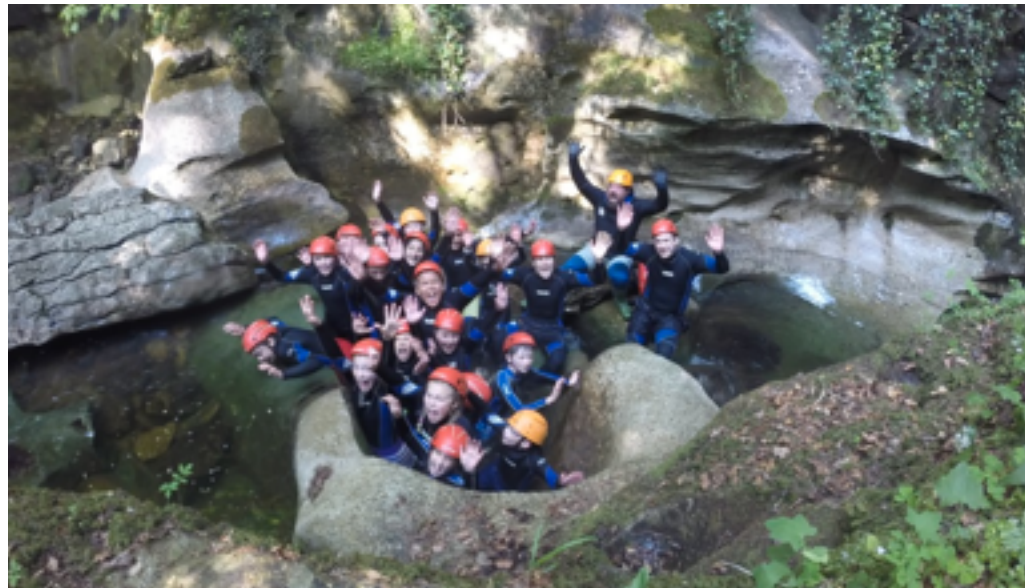
6CH 'Gorge Walking' at How Stean on Monday

Year 6 are enjoying a new OAA residential this week: three days for each class at How Stean Gorge near Pateley Bridge. They are camping (lucky with the weather) and are engaged in some very challenging OAA including abseiling, gorge walking, kayaking and 'via ferrata'.